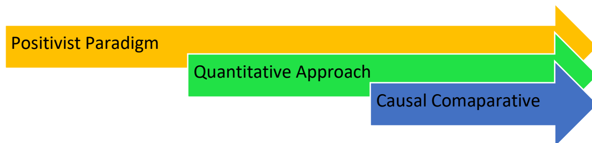
Figure 2: Research Design of the Study

causal-comparative method was used. In the words of the authors (Gay, et al., 2011), causal-comparative is the type of research where the purpose of conducting the research is to explain the reason for the prevalent differences in the behaviour or position of the group of individuals. The following figure elaborates the research design of the current study: